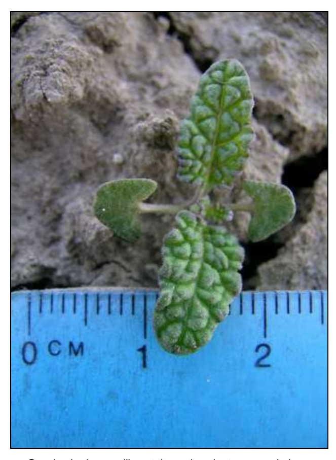
S. columbariae seedling at the native plant nursery during February 2006.