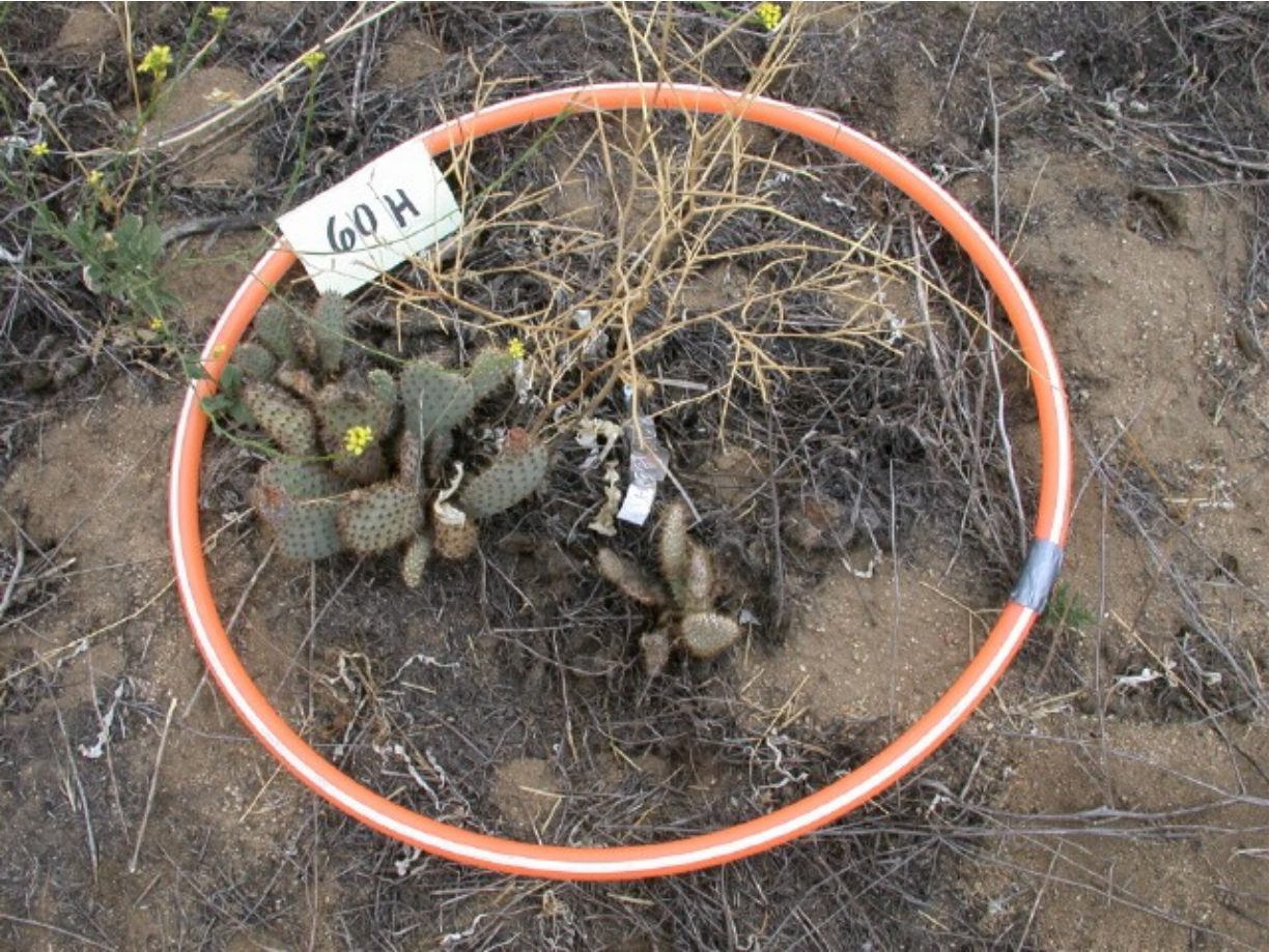
Herbicide-treated plot in May 2004 containing the non-native Sahara mustard ( Brassica tournefortii ) in addition to Bakersfield cactus. The green plant growing in the sprayed buffer area adjacent to the plot is the non-native short-pod mustard ( Hirschfeldia incana ).