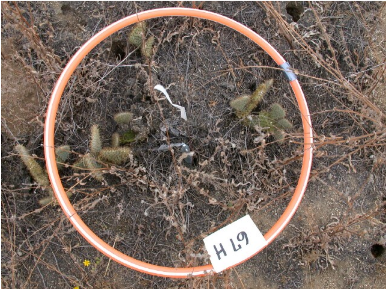
Representative herbicide-treated plot in May 2004.