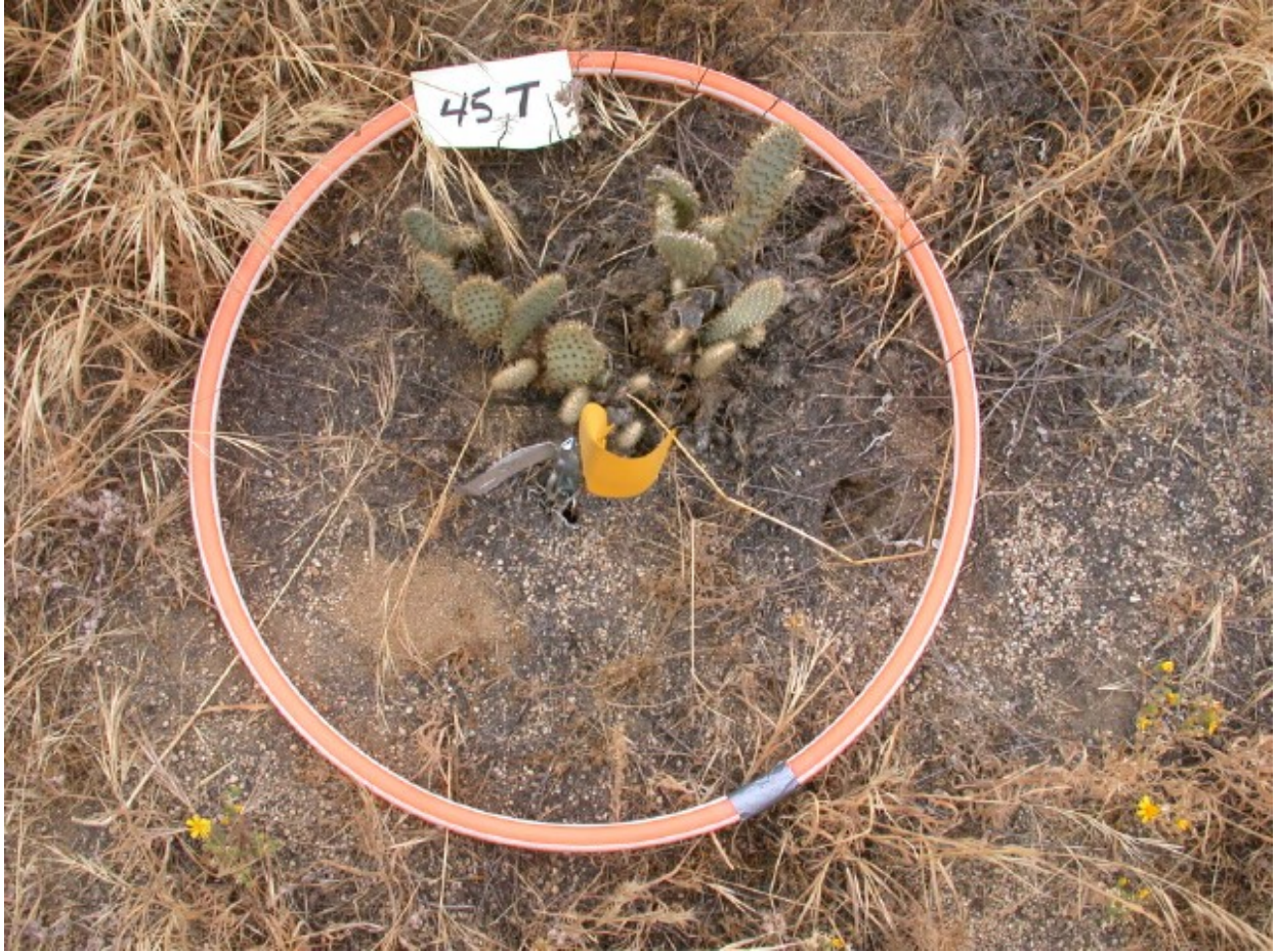
Representative clipped plot in May 2004.