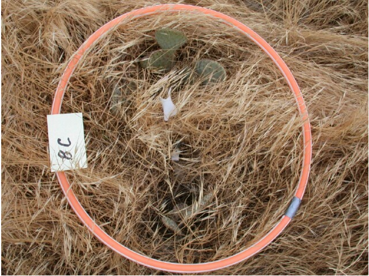
Representative control (unmanipulated) plot in May 2004.